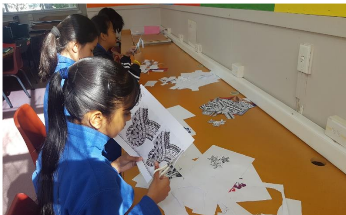
Cutting Samoan patterns ready to decorate our hall for our Samoan language assembly.