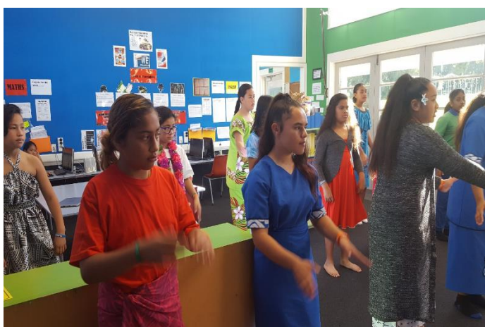
Senior girls practicing for our Samoan Language Assembly.