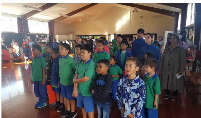
Singing the Samoan National Anthem.