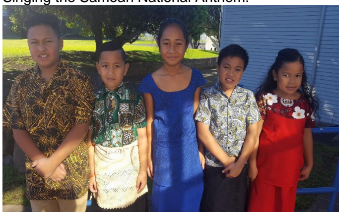
Room 3 dressed for Samoan Language Week.